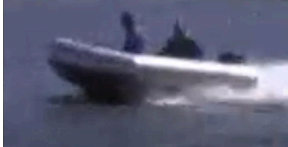
3300 LONGBOAT CARTOPPA

Designed to reduce hull friction and enhance comfort and ride, PosiLift Hull Technology precisely lifts the hull to optimise unmatched stability and energy recycling during every drive