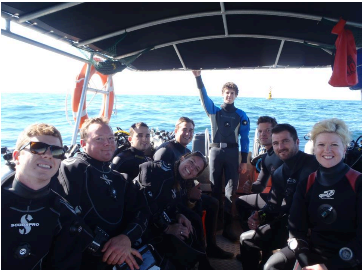
8200 DIVE CHARTER BEAMY (11 divers +2 Crew)