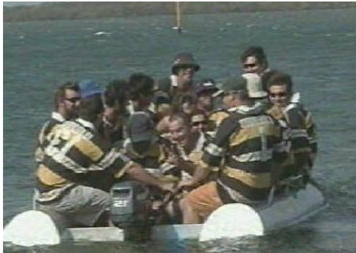
4300 LONGBOAT ( with 20 rugby players on board )