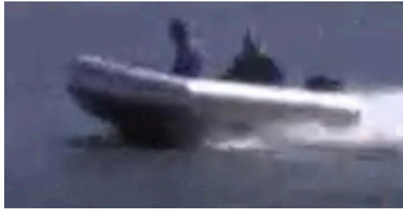
3300 LONGBOAT CARTOPPA

Designed to reduce hull friction and enhance comfort and ride, PosiLift Hull Technology precisely lifts the hull to optimise unmatched stability and energy recycling during every drive